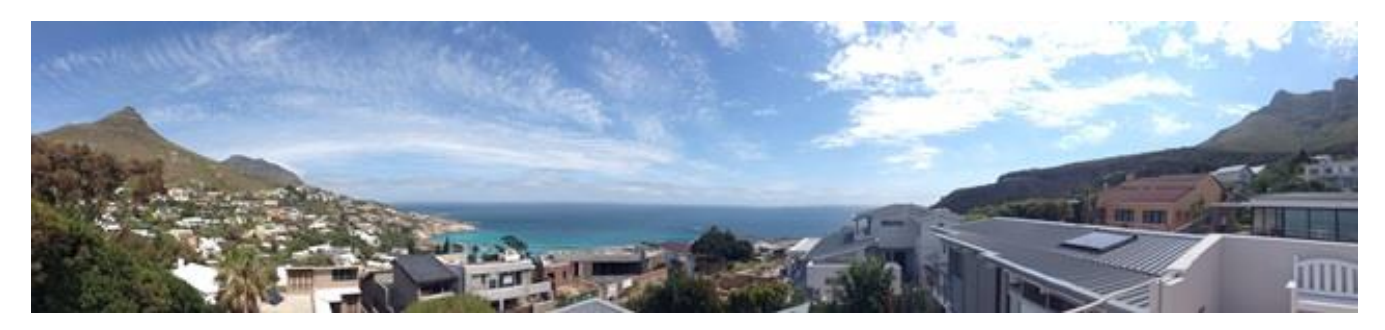
GPS Co-ordinates 34° 0'26.55"S 18°20'41.54"E