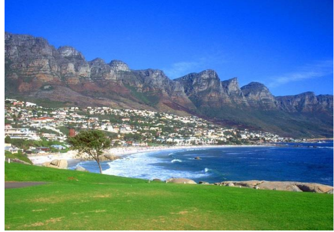
Table Mountain Cable Way

Since its opening in 1929, over 16 million people have taken the trip to the top of Table Mountain. The Table Mountain cableway has since become something of a landmark in Cape Town having a revolving floor that allows passengers a 360-degree view of the city and Table Mountain as they travel. It can be reached by heading up Kloof Street, then turning left at the saddle between Table Mountain and Lion's Head onto Tafelberg Road.