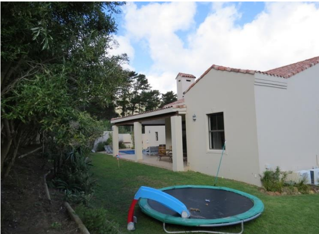
GPS Co-ordinates 34° 0'56.85"S 18°21'53.77"E