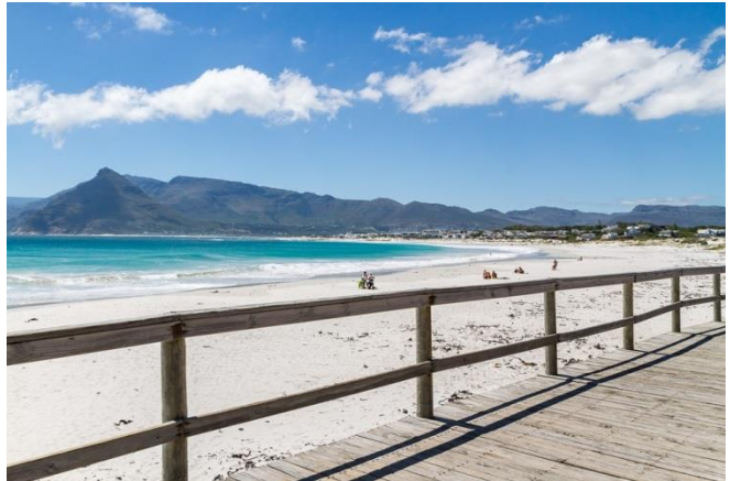
View from the beach deck