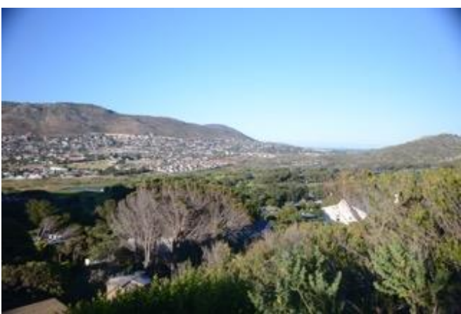
GPS Co-ordinates 34° 7'26.21"S 18°26'0.41"E