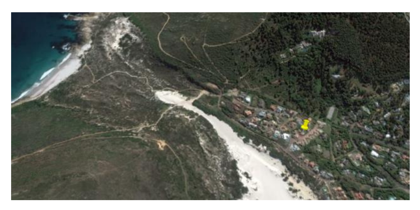
GPS Co-ordinates 34° 1'36.05"S 18°20'34.99"E