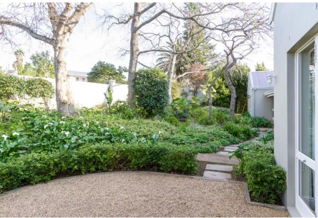
GPS Co-ordinates 34° 0'54.15"S 18°25'49.89"E