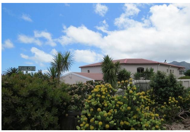
GPS Co-ordinates 34° 6'22.25"S 18°23'40.99"E