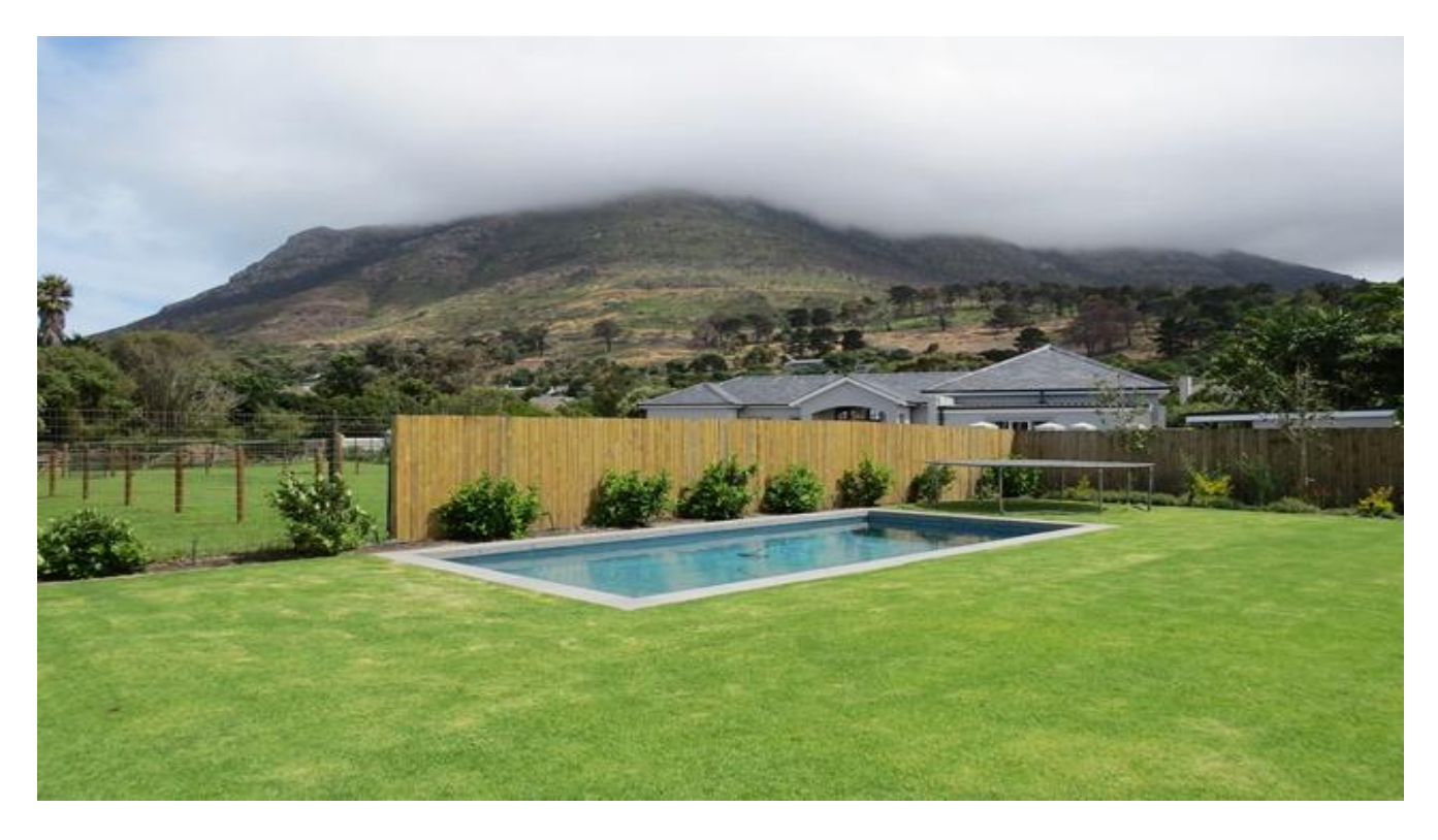
GPS Co-ordinates 34° 6'1.94"S 18°22'5.67"E