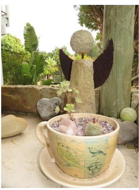
GPS Co-ordinates 34° 8'21.44"S 18°19'52.88"E