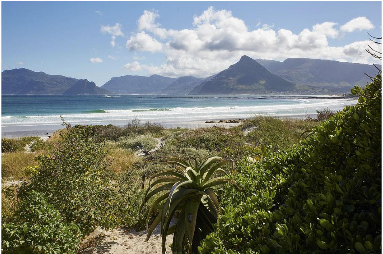
This is not the view from the house but 50m from the doorstep.