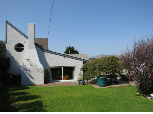
GPS Co-ordinates 34° 5'51.56"S 18°21'52.85"E