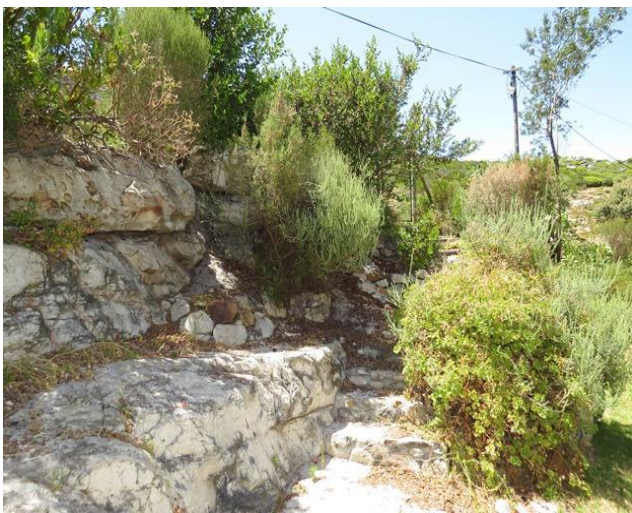
GPS Co-ordinates 34°11'39.34"S 18°22'33.68"E