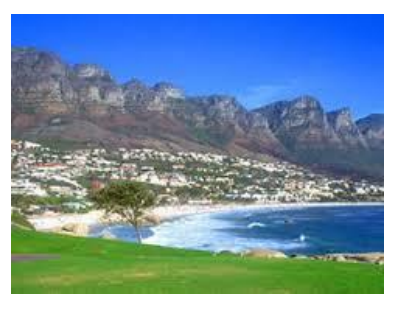
GPS Co-ordinates 33°57'18.65"S 18°23'4.65"E