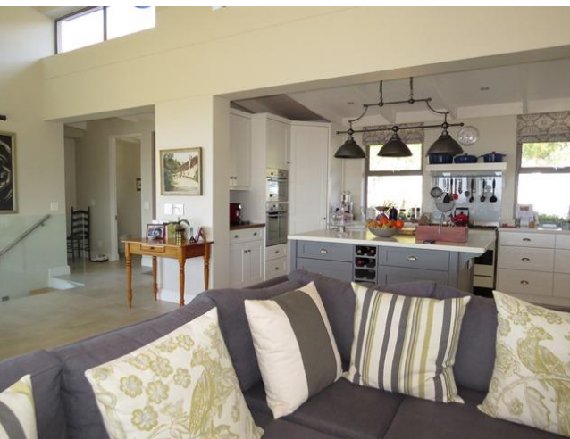
GPS Co-ordinates 34° 4'55.86"S 18°25'58.53"E