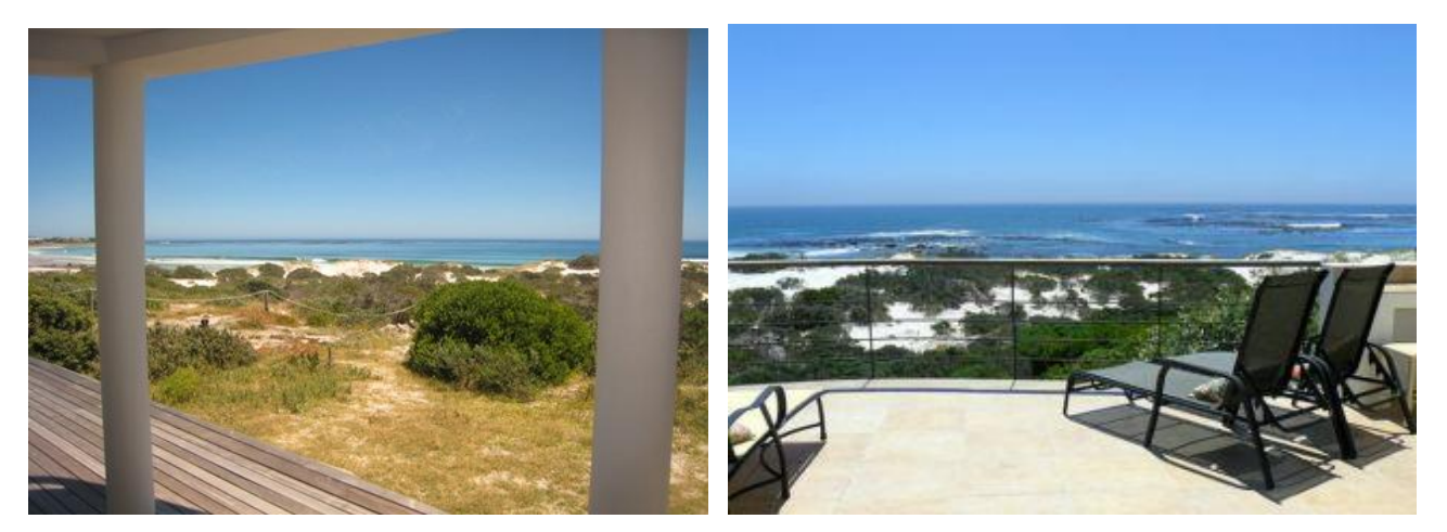
Google co-ordinates 34°07'57.82 S 18°20'12.71 E