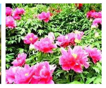
GPS Co-ordinates: 34° 0'59.66"S 18°21'53.28"E