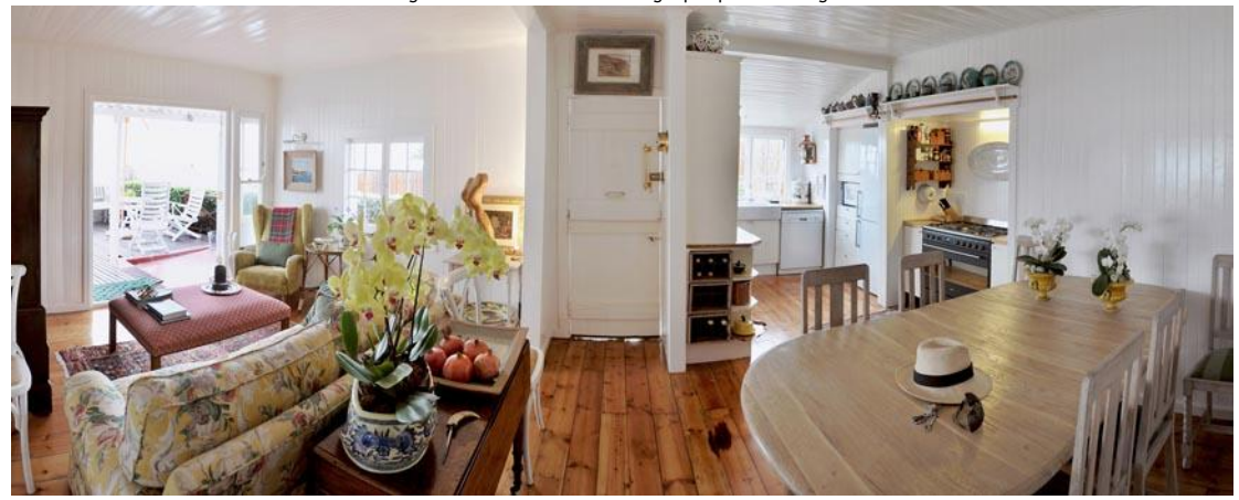
All the living space is open plan with many windows giving each room plenty of light