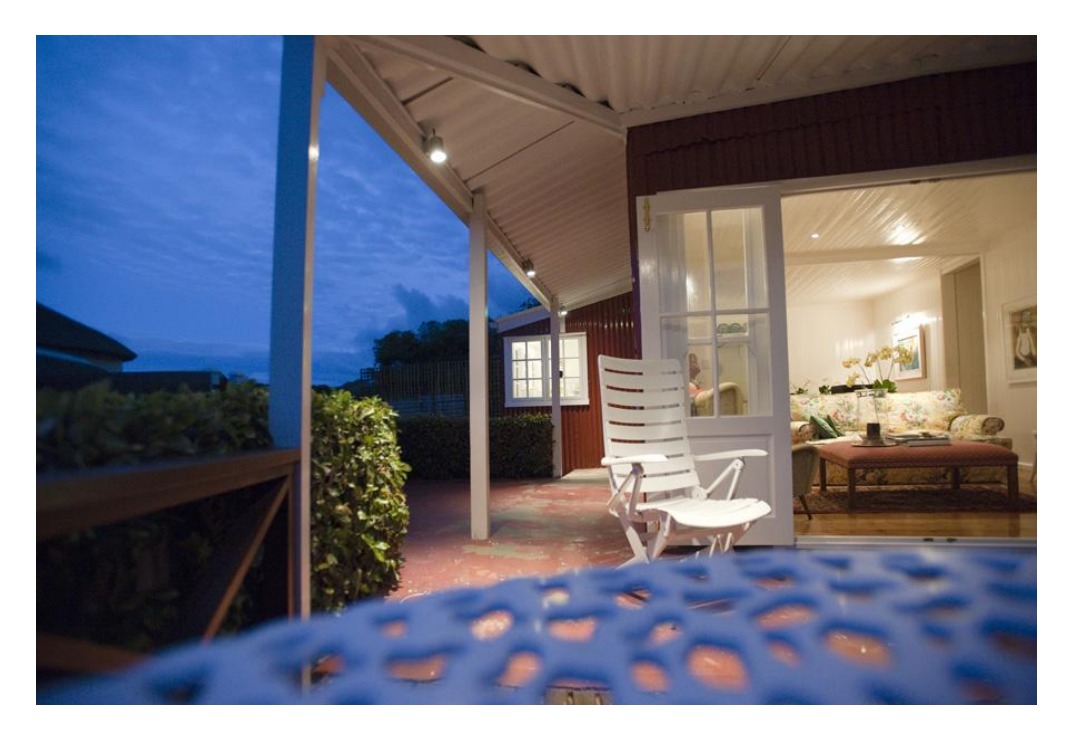
A terrace view into the light and open living space