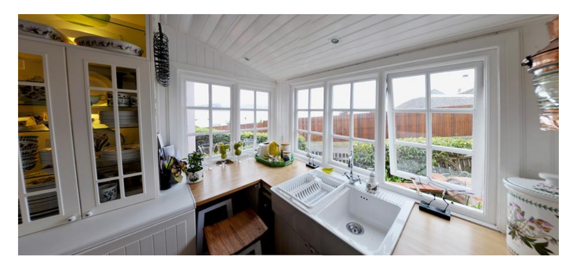
A large and light fully equipped kitchen with a view onto the garden